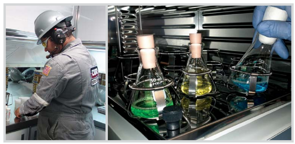
Petro-Flo™ Microbiocide is a registered trademark of Bio-Cide International. Used with permission.

One key additive in our suite of environmentally responsible products is the Petro-Flo™ Microbiocide. Petro-Flo™ Microbiocide offers a safer, more effective biocide alternative for fracturing applications. Its unique chemistry effectively controls bacteria that produce slime, sulfates and acid; it penetrates biofilm to aggressively break it down from within and prevents new biofilm from forming. This product is just one example of the products and processes used to deliver superior treatment results in an environmentally responsible manner.