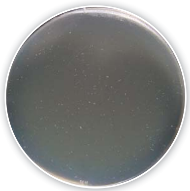
Treated with Petro-Flo™ Microbiocide